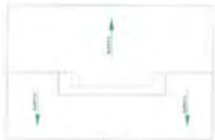
ROOF PLAN Scale 1/4" = 1'-0"