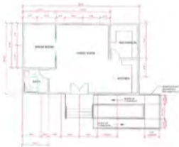
FLOOR PLAN Scale 1/4" = 1'-0"

DESIGNER'S NOTE: 1. ALL DIMENSIONS ARE IN FEET AND INCHES. 2. ALL DIMENSIONS ARE TO FACE UNLESS NOTED OTHERWISE. 3. ALL DIMENSIONS ARE TO CENTER UNLESS NOTED OTHERWISE.